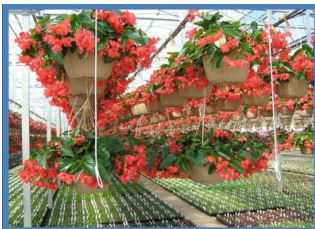
Dragon Wing Begonia