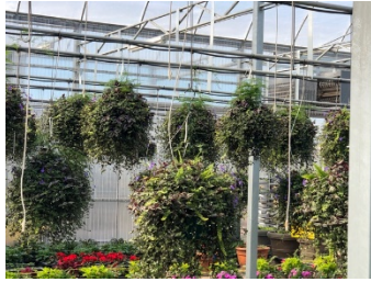
Foliage Combo Basket