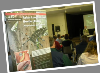
Greene County MGVs hold educational workshops that are open to the public. Programs will be announced in local newspapers and on the web site.

As part of a vibrant, statewide, volunteer organization, MGVs receive more than 50 hours of classroom training through the Ohio State University Extension in areas of botany, soils, entomology, plant diseases, Integrated Pest Management, pesticide use and safety, lawn care, fruits, vegetables, shrubs, herbs, annuals, perennials and more. The program is designed to meet the consumer horticulture needs of Ohio citizens. While volunteers do work on select community service projects, most activities provide education and outreach. MGVs become leaders and educators in their communities and provide UNBIASED RESEARCH-BASED EDUCATION through workshops and programs in the areas of HEALTH AND WELLNESS, JOB SKILLS AND CAREERS, THRIVING ACROSS THE LIFE SPAN, SUSTAINABLE FOOD SYSTEMS, ENGAGED OHIOANS AND VIBRANT COMMUNITIES, AND ENVIRONMENTAL QUALITY.