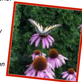
Providing food for pollinators, in this case a black swallowtail butterfly on purple cone flower, is integral to gardening basics. Bellbrook Butterfly Garden